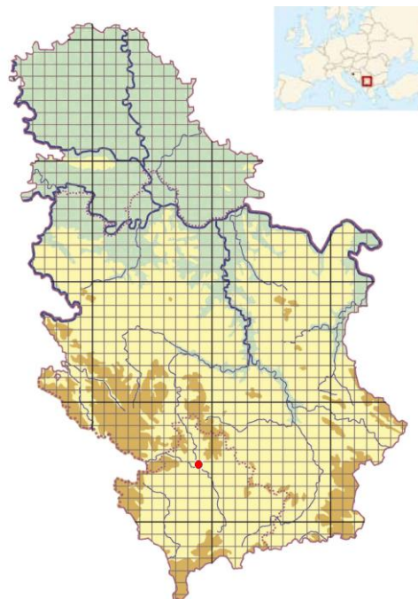
Figure 1. Geographical position of investigated area (town of Kosovska Mitrovica) in Serbia (marked with red point)

The town of Kosovska Mitrovica, with its surroundings, lies between 42° 53' north latitude, 20° 52' east longitude, and 496-510 altitude, and stretches to the farthest northern point of Kosovo Valley ( Fig. 1 ). It is situated in the alluvial area and on the terraces of the Ibar and Sitnica Rivers, with the volcanic cup of Zvečan dominating the city. The largest part of the territory is considered mountaineous. More than half of the city and its surroundings consists of brown shallow soil with poor fertility. It should be emphasized that, influenced by heavy industry, many types of soil have undergone degradation and "enrichment" with various waste products that reduced their fertility. The climate is marked as moderate-continental. Mitrovica is located among Kopaonik and Rogozna mountains, hence the annual precipitation is low (600 mm on average).