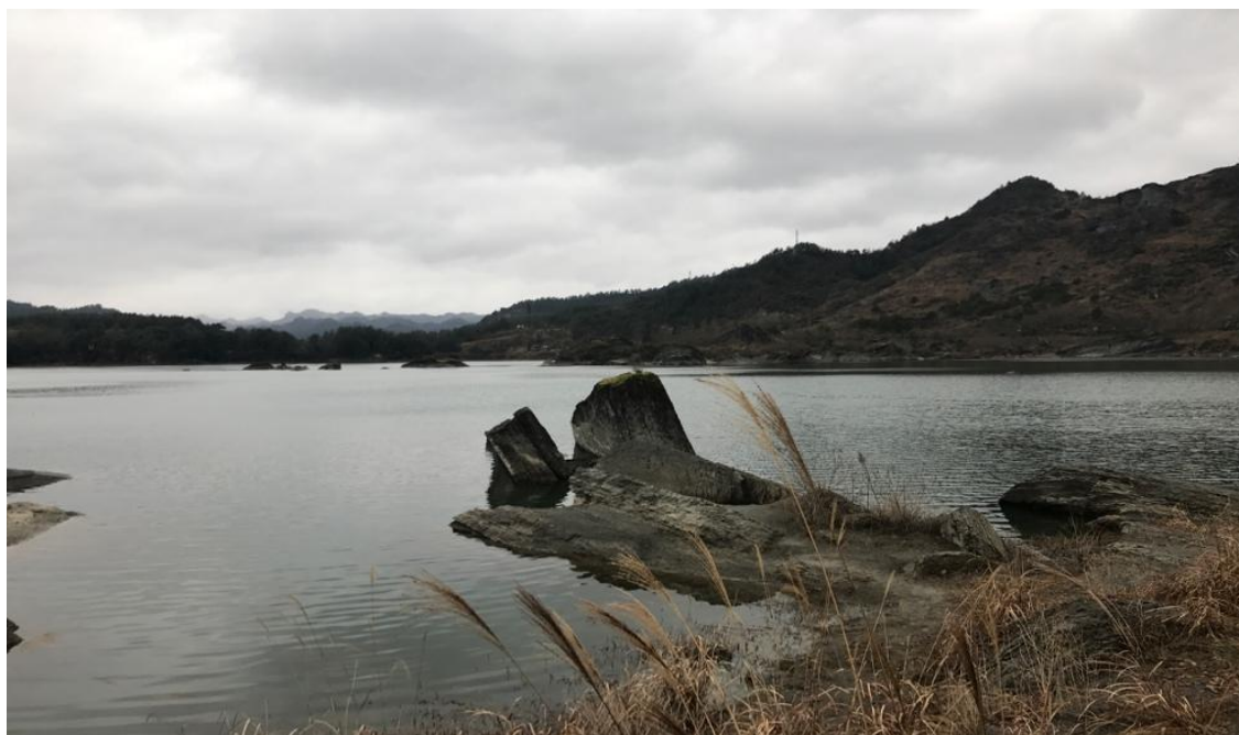
Figure 1. The experimental site of Qianjiang Xiaonanhai National Geopark

science popularization for public and scientific research for experts and scholars. It can provide sightseeing, leisure and other tourist activities with scientific education. Figure 1 shows the research site.