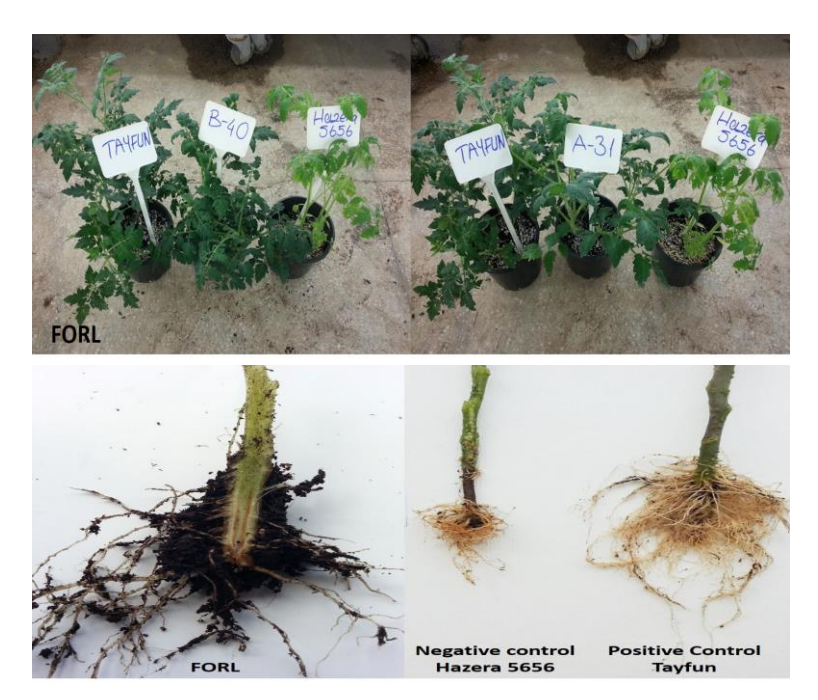
Figure 5. Classical test study of A-31 and B-40 genotypes from resistant tomato lines of FORL disease

It was determined that there were no symptoms of FORL induced crown and rot-root disease in all tomato genotypes in the experiment group as a result of the plant and root assessments ( Figure 5 ).