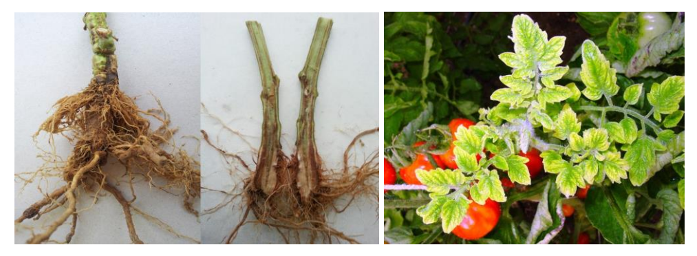
Figure 1. FORL and TYLCV symptoms in tomato plants

The FORL isolate was obtained from Mersin greenhouse tomato plants and it was determined that it was a molecular (PCR) FORL isolate with high virulence, and the study was conducted with the FORL isolate coded Tarsus-0 (Tarsus / Mersin isolate) and stored at -20^{\circ} C ( Figure 1 ) (Colak and Bicici, 2011).