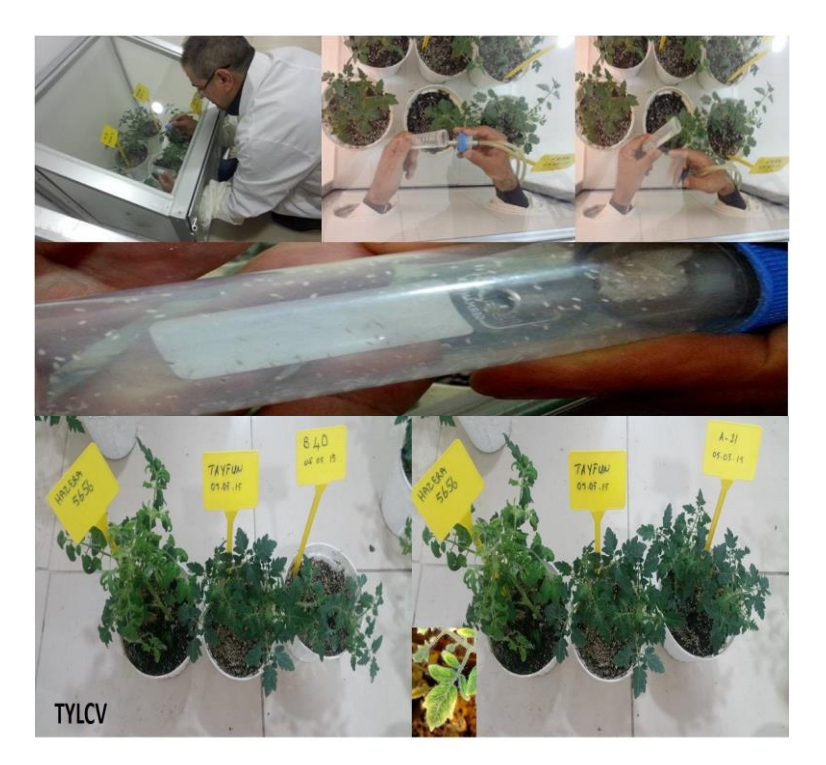
Figure 6. The release of white flies collected on TYLCV infected plants in special cages for tomato lines taken to the TYLCV resistance test and classical test study of A-31 and B-40 genotypes from resistant tomato lines of TYLCV disease

Furthermore, it is not possible to set up experiments with whiteflies for hundreds of breeding lines. In the present study, the use of molecular markers reduced the number of genotypes from 418 to 7 tomato genotypes (B26, B40, B178, A31, A41, A48 and A66) that were resistant to all three factors (FORL+TY1+TY3), making it easier and more economic to verify these findings with classical tests. Although molecular markers provide a great advantage in terms of speed and cost, classic validation tests should be performed (Lee et al., 2015). This is due to the fact that it is important to perform classical validation tests (smyptomatologic) in determination of MAS-selective resistance, which taking the distances between the developed markers and the gene and human and marker-based errors into consideration (Caro et al., 2015; Scott et al., 2015).