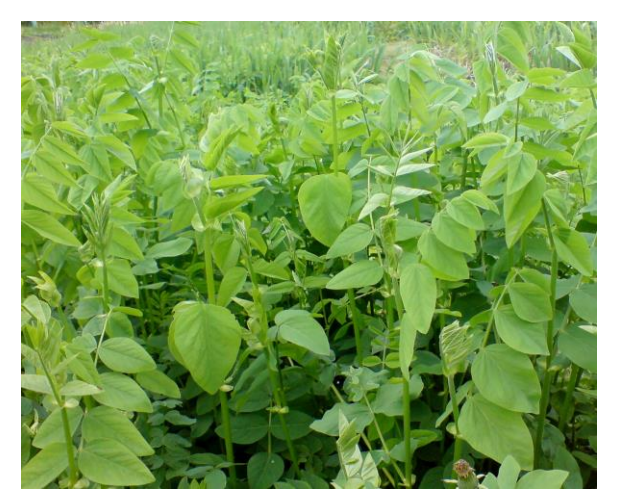
Figure 2. Fodder galega (Galega orientalis Lam.) – budding phase

– 6.6. The content of available forms of phosphorus and potassium in soil determined with the Egner-Riehm's method was high (80 mg·kg<sup>-1</sup> P and 140 mg·kg<sup>-1</sup> K) and the content of magnesium determined with the Schachtschabel's method was average (50 mg·kg<sup>-1</sup> Mg). According to the IUSS World Reference of Soil resources (2014), the soil on which the field experiment was carried out was classified as Hortic Anthrosol . The fodder galega seeds was sown in the amount of 24 kg·ha<sup>-1</sup> (300-500 plants per 1 m<sup>2</sup>). The germination was 45-60% and the 2.4 grams was TGW. Mechanically scarified seeds were sown into soil inoculated with Rhizobium galegae bacteria. In the subsequent years, the following fertilization scheme was implemented: N – 20 kg·ha<sup>-1</sup> as 34% ammomium nitrate applied in early spring; P – 50 kg·ha<sup>-1</sup> as triple superphosphate applied in autumn; K – 150 kg·ha<sup>-1</sup> as 60% potassium salt at two doses: dose I (100 kg·ha<sup>-1</sup> K) applied in early spring, dose II (50 kg·ha<sup>-1</sup> K) applied after the first swath; Ca – 150 kg·ha<sup>-1</sup> as dolomite calcium applied in autumn. During vegetation, agricultural procedures such as weeding were performed. The three swaths of fodder galega were harvested at budding in each, subsequent crop year ( Figure 2 ).