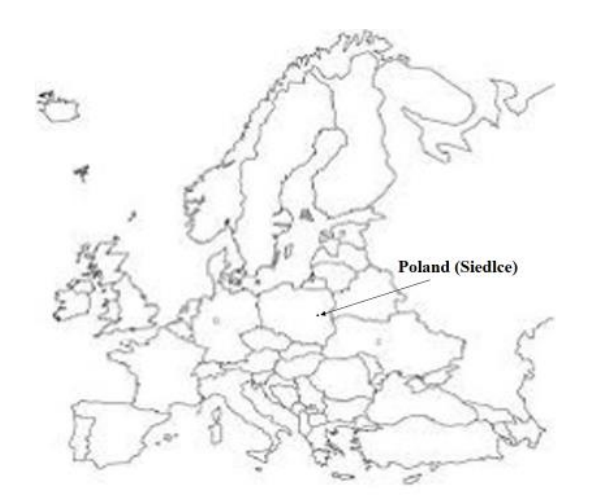
Figure 1. Location of the study area [https://contour maps.com.pl] in the own modification

In the years between 2005 and 2009 the field experiment was set up with a completely randomized method in three replications, on the experimental plots of the Soil Science and Plant Nutrition Department at the Siedlce University of Natural Sciences and Humanities, Poland - 52^{\circ}17 'N, 22^{\circ}28 'E ( Figure 1 ).