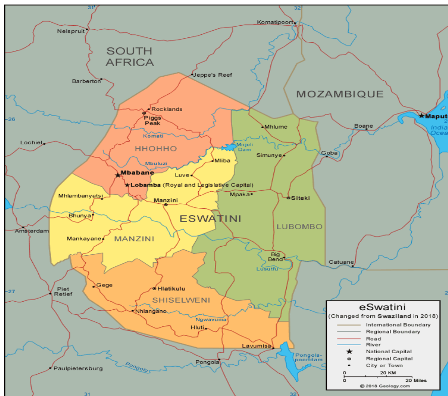
Figure 1. Map of eSwatini.