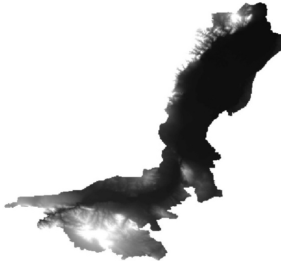
Figure 1. DEM Map of Ningxia Section of the Yellow River Basin

SWAT (Soil and Water Assessment Tool) model was adopted as hydrological forecast model to simulate the hydrological circulation process in Ningxia section of the Yellow River Basin. This model could be used for short-term, middle-term and long-term hydrological forecast as well as for the evaluation of water resource regime in future climate scenarios. In the modeling process, the testing data of the meteorological and hydrological stations were taken as the input source to calibrate and test the model parameters. The simulation was based on the meteorological and hydrological data of Ningxia section from 1990 to 2012. With relative error R_e , correlation coefficient R^2 and Nash-Suttcliffe coefficient E_{ns} as the standards, the sensitive parameters of the model were calibrated with the actually measured monthly runoff volumes within 2000-2006 and the model was validated with the actually measured monthly runoff volume within 2007-2012. The relative error R_e between the calibration period and the verification period was close to 10%, the correlation coefficient R^2 and Nash-Suttcliffe coefficient E_{ns} were larger than 0.86 and 0.85 during the calibration period, with good simulation results. This suggests that this model is applicable to hydrological simulation of Ningxia section of the Yellow River Basin and could be used for quantitative and qualitative study of the basin under future climate changes. The DEM map of study area see Fig. 1 .