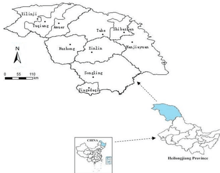
Figure 1. The geographical location of study area and plot distribution in the Northeast China

A total of 5474 individual height-diameter measurements for four Conifer Forest tree species were collected in systematically/randomly selected square/circular (25.8 m x 25.8 m plots) using field Inventory from Daxing'an Mountains in the northeast of China (Figure 1). A county was assigned as part of a specific ecoregion if a majority of the land base fell within ecoregion boundaries. The selected ecoregions are a combination of the different subregions between them and the land base regions identified by the China Soil Conservation Service. In this study, only one species of tree, the Dahurian larch ( Larix gmelinii Rupr) was selected, given the absence of some data for other tree species.