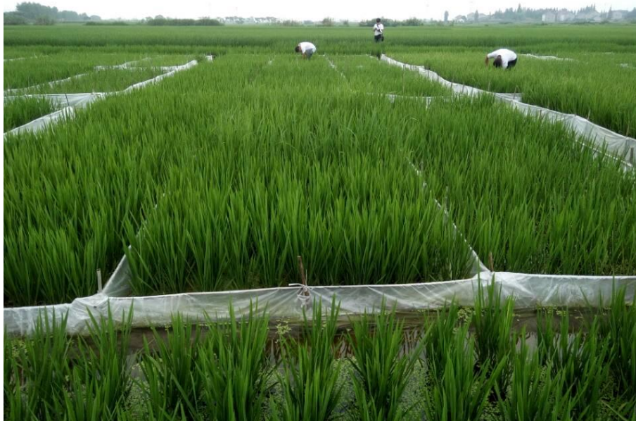
Appendix I. Photo of the experiment