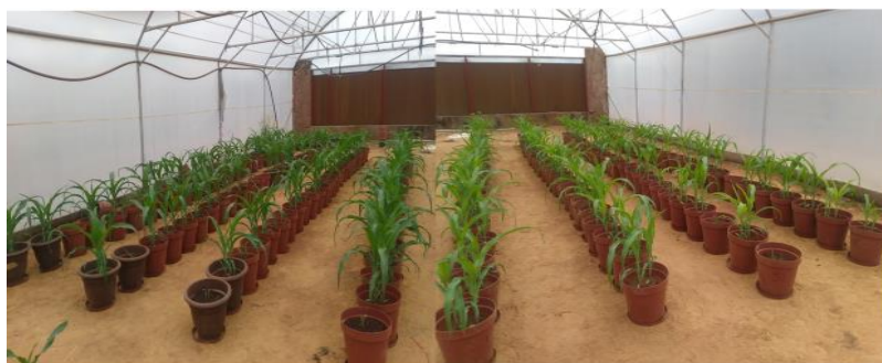
Figure 1. An experimental layout in completely randomized design for the pot experiment of maize cultivation

et al., 2016). The holes at the bottom of each pot were blocked using cotton wool in order to prevent soil losses. Pots were watered with municipal water, thereafter allowed to equilibrate for 5 hours prior to sowing three seeds of maize (cv. WE6206B) in each pot. Maize seedlings in each pot were thinned down to two seedlings after one week of seedling emergence. The pots received uniform irrigation throughout the period of plant growth. The trial was terminated at 7 weeks after planting by harvesting plant shoots. The seedlings in pots treated with composts at 80 and 100 t/ha died after showing signs of salt stress one week after emergence. Consequently, soil samples were collected from each pot and analyzed for exchangeable soil-Na content. The soil test results revealed that the application of WSW compost at 80 and 100 t/ha significantly increased the exchangeable soil-Na content by up to 175%, which may be the reason for the death of the seedlings (data not shown).