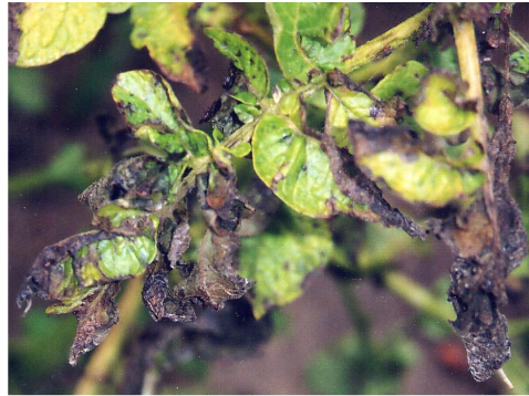
Figure 1. Potato plant with late blight ( P. infestans )

leaves. Lesions often begin to develop near the leaf tips or edges, where dew is retained longest. During cool, moist weather, these lesions expand rapidly into large, dark brown or black lesions, often appearing greasy (Fig. 1). The lesions are not limited by leaf veins, and as new infections occur and existing infections coalesce, entire leaves can become blighted and killed within just a few days. The lesions may expand down petioles and stems of the plant.