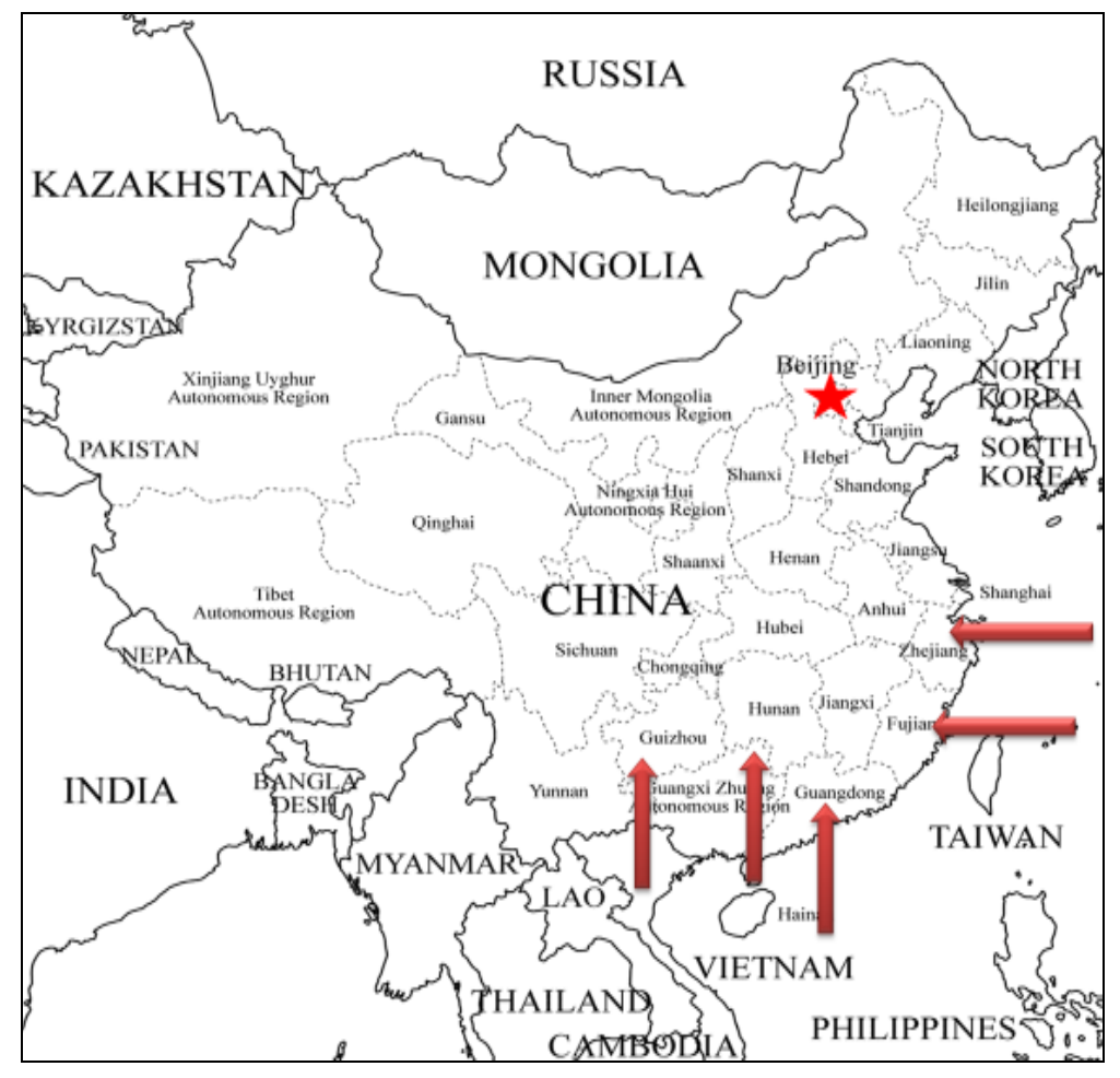
Figure 2. Presence of C. gilva in the southeastern ecological region of China