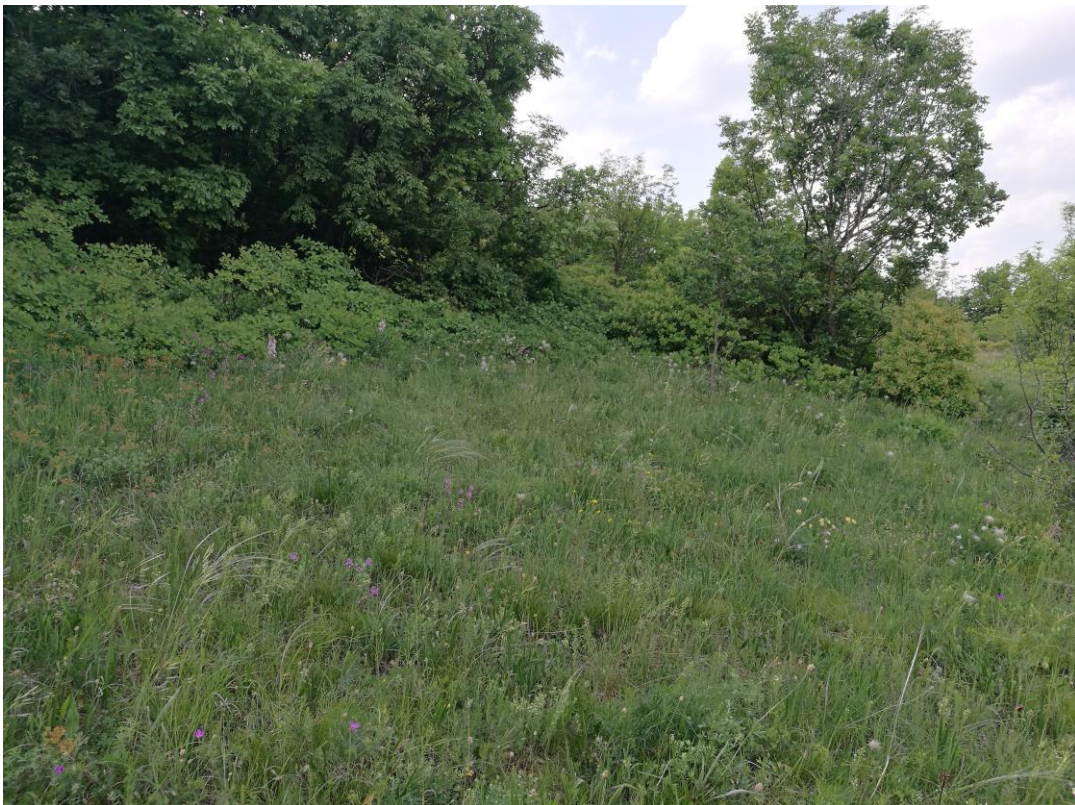
Figure 3. Experimental site.