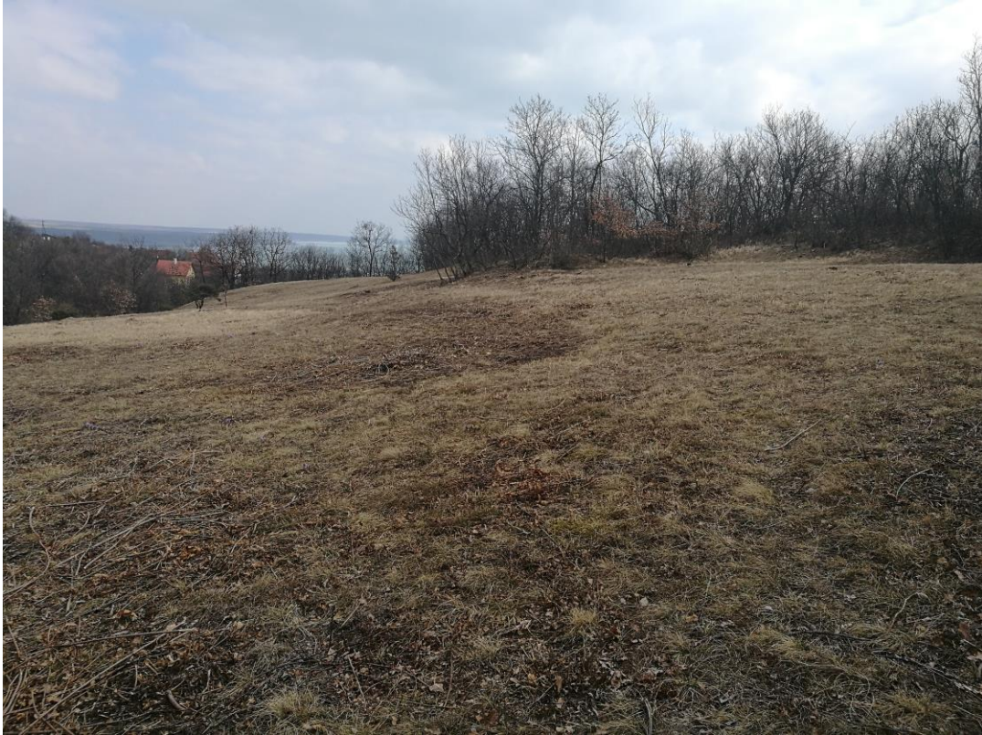
Figure 2. Experimental site.