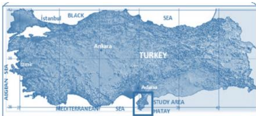
Figure 2. Hatay province of Turkey (Demirkesen, 2012)