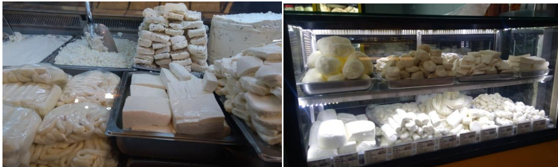
Figure 1. Traditional cheese collected from local market on a small scale in Hatay province

In this study, totally 20 cheese samples were collected from small scaled local market in Hatay province, Turkey ( Figure 1 and Figure 2 ). For all identification tests, pathogenic bacteria including Escherichia coli ATCC-35150, Salmonella spp., Listeria monocytogenes ATCC7644 (Remel-USA) and Staphylococcus aureus ATCC-25923 was used as indicator organisms for the aim of positive control. Pathogen bacteria were grown in BHI (Merck, Germany) and stocked at -20^{\circ}\text{C} in BHI supplemented with 20% (v/v) glycerol.