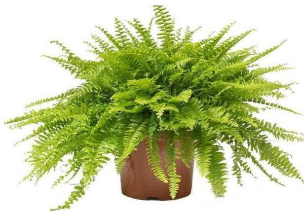
Figure 1. Nephrolepis exaltata Schott (Boston fern)

were chopped to (1.0 cm) long segments (explants) before being put individually in - MS medium free hormones for three weeks. Each treatment included nine explants for three replicates. At the end of the sterilization period percentages of contamination-free, and surviving explants were calculated. Contamination-free and surviving explants were taken for multiplication stage.