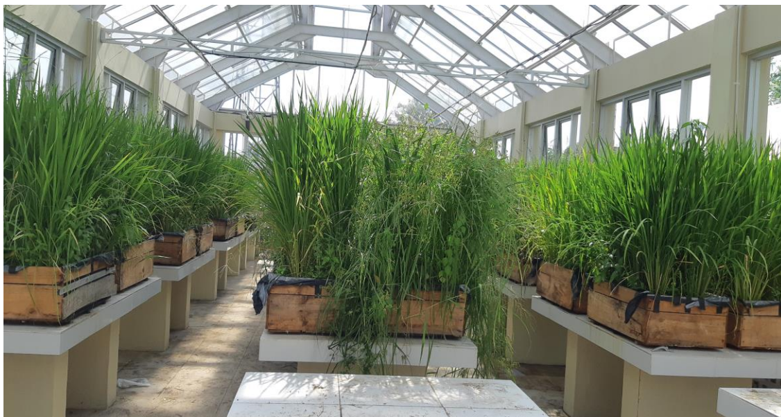
Figure 2. Photo of the experimental culture at 60 DAP

The same works were done for all weed species that grew in all sample plots. Each weed species from each treatment was entered in paper bags and was dried for one week in the solar thermal. All treatments were done in the same way. Each weed species in the paper bag was dried in a Binder drying oven ED series for 48 hours at 80 °C or until the dry weight was constant. The weed dry weight was calculated according to the species, while weed dry weight was calculated from all weed species in one wooden box. Weed dry weight was measured using the ACIS AD-i Series digital analytical balance.